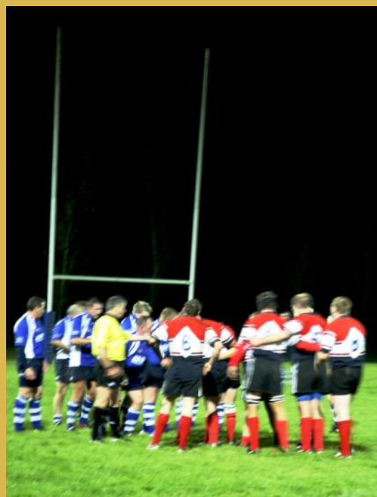
The two teams playing under the flood-lights provided by GFF.